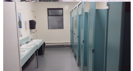
Bathroom & shower facilities